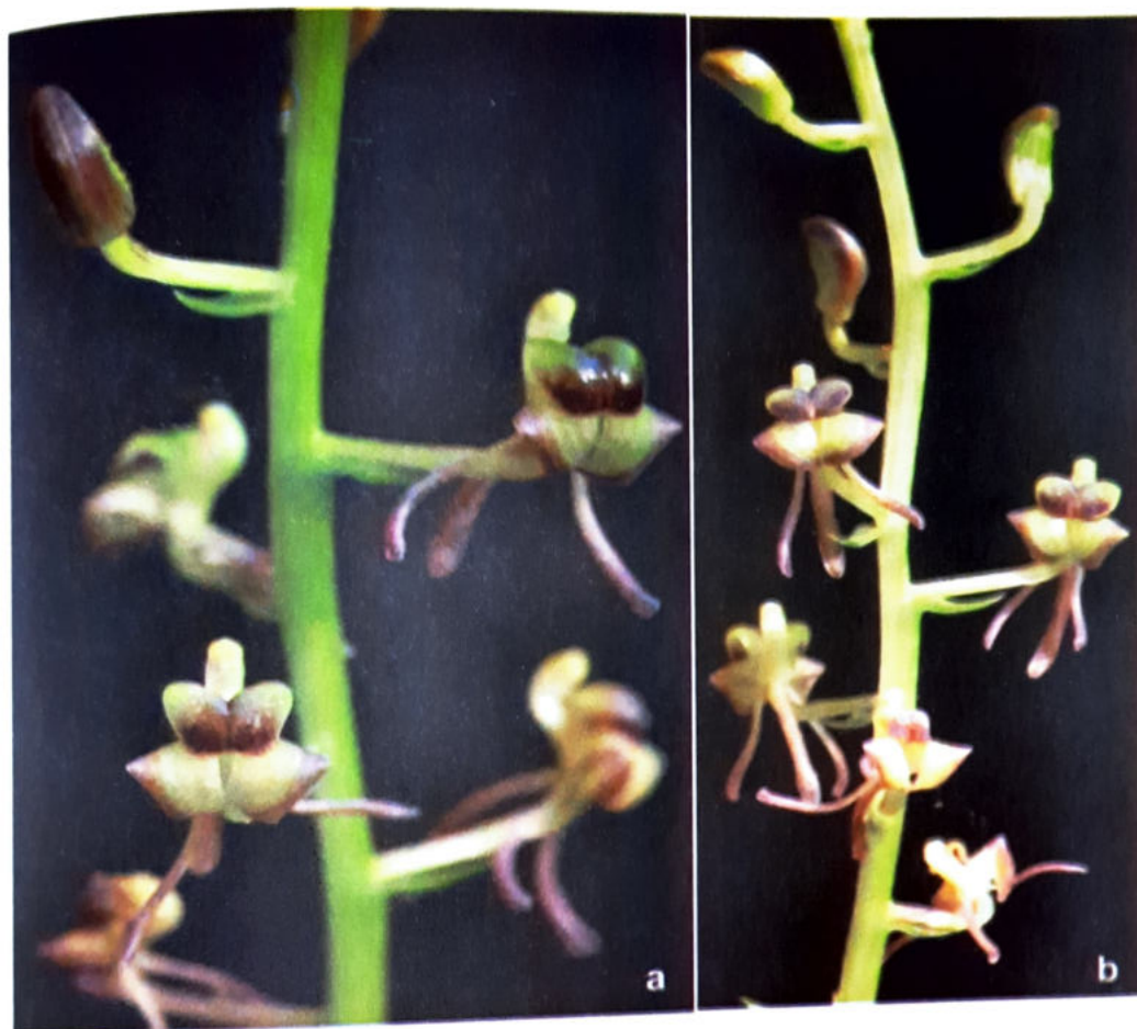
Fig. 2 a-b. Liparis udaii .

is now designated as the lectotype i.e. , S. Misra 2495, lectotype CAL (Art. 9.12 ICN - 2012).